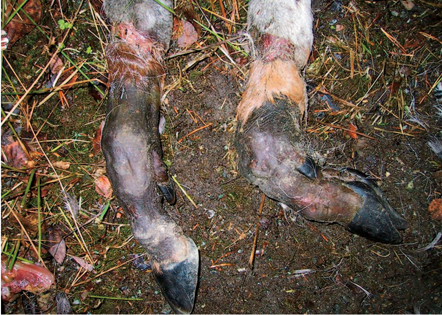
FIGURE 1. Moose calf (no. 3) showing bilateral gangrene of the hind limbs extending up to the distal third of the metatarsus. There is discoloration and loss of hair in the necrotic skin, and separation of the skin between necrotic and viable areas. Rims of unshed brown calf haircoat are seen distal to the separation zone.