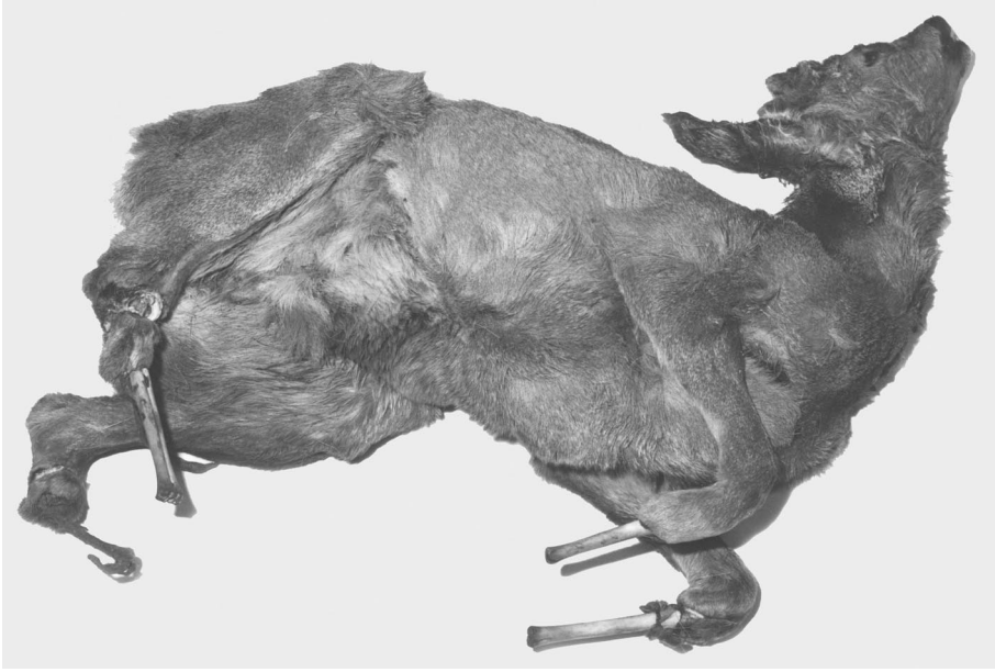
FIGURE 4. Roe deer (no. 11) showing loss of all digits and the naked metacarpal/metatarsal bone shafts with disintegrated skin and muscles advancing up to the proximal third (the left metatarsal bone had fractured during transportation and is not seen on this photograph). Wear, erosion, and discoloration are seen on the bone ends.

is difficult to confirm, especially in free-living animals that are not normally seen until lesions are in an advanced state, long after the toxic insult has ceased. The differential diagnoses would include conditions such as trauma, accidental ligation of the appendages, bacterial infections, and the effects of cold. In nine of the reported cases, there were multifocal lesions, indicating systemic vasoconstriction that was not consistent with trauma or ligation. There also were no indications of a primary bacterial infection. Both roe deer and especially moose are well adapted to the cold climate found in northern latitudes, making frostbite an unlikely cause. However, it should be kept in mind that low temperatures during late autumn and winter may have exacerbated the circulatory disturbances and the loss of extremities in these animals. Low environmental temperatures have been suspected to exacerbate clinical signs of gangrenous ergotism in domestic ruminants (Woods et al., 1966).