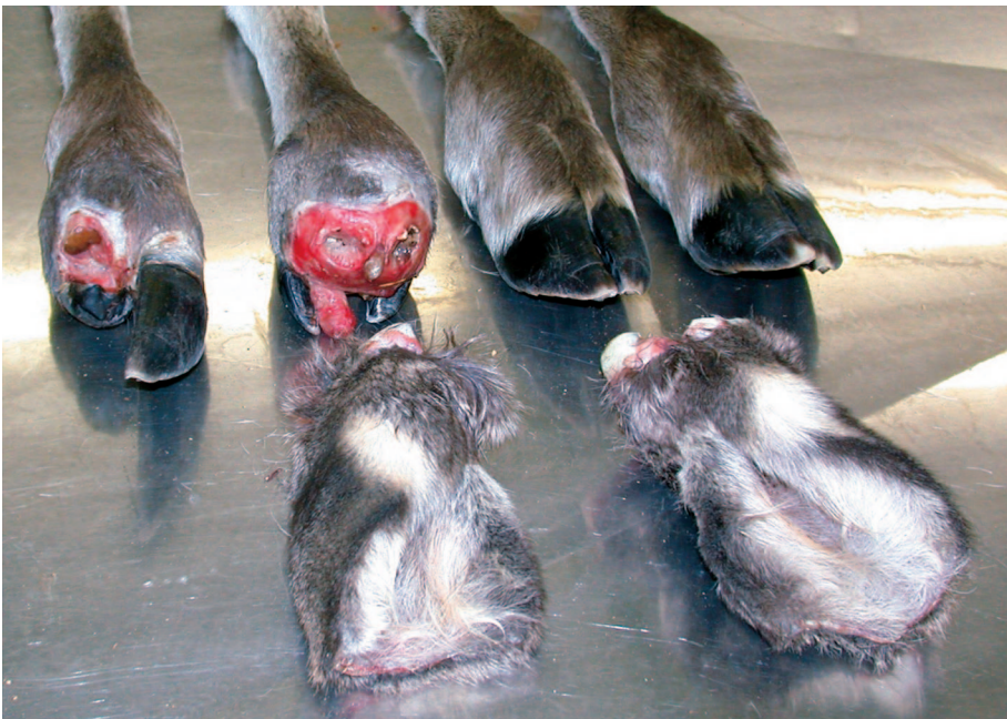
FIGURE 2. Moose calf (no. 1) showing unilateral (left) and bilateral loss of the distal and medial phalanx of the two hind limbs, as well as both ear tips. The forelimbs are normal. Swelling and exposure of the medullary cavity of the proximal phalanges are seen in the limb with bilateral lesions.